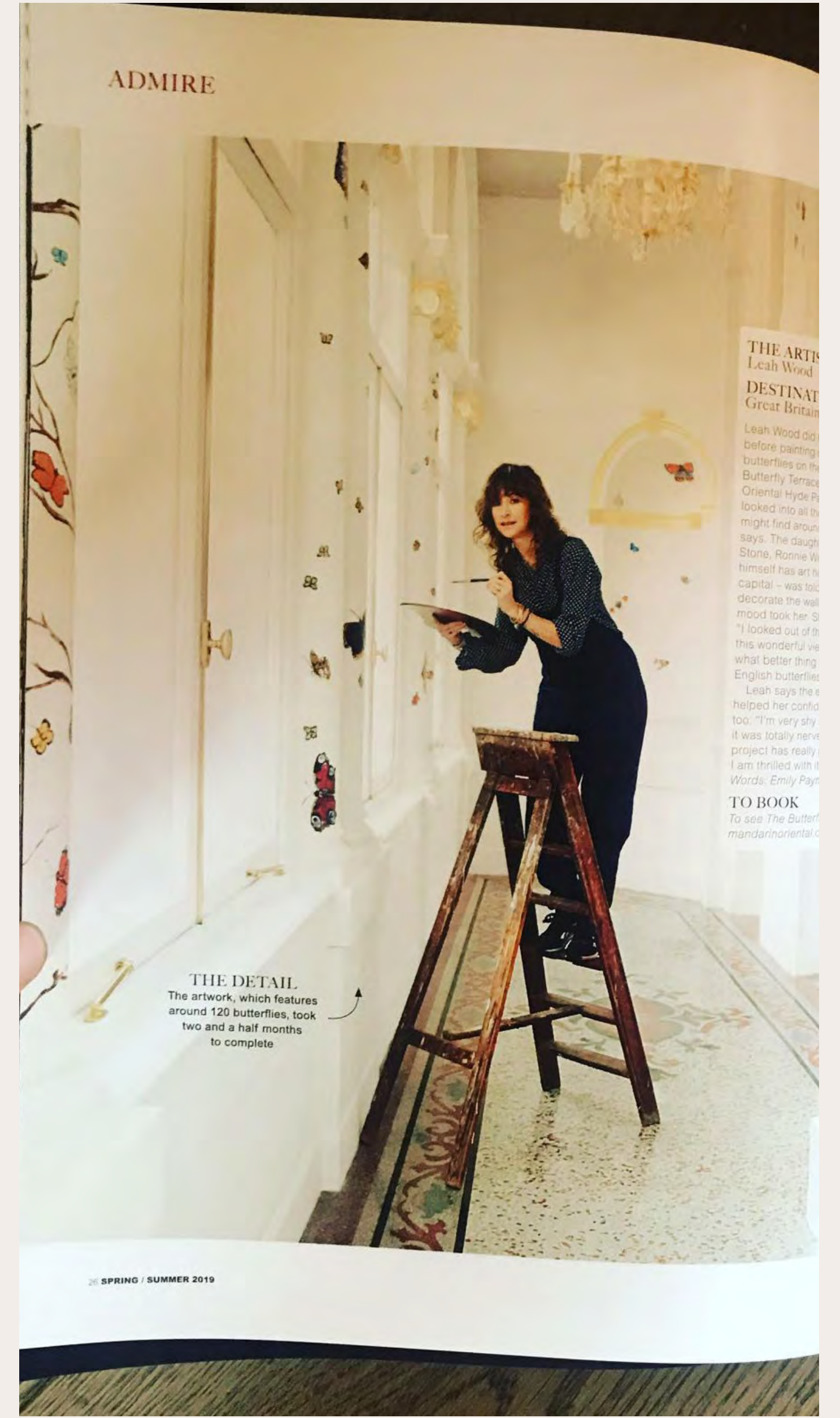
BUTTERFLY TERRACE, MANDARIN ORIENTAL